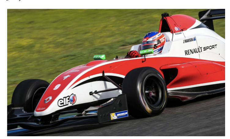
Formula 4 Jerez 2014 - podium finish